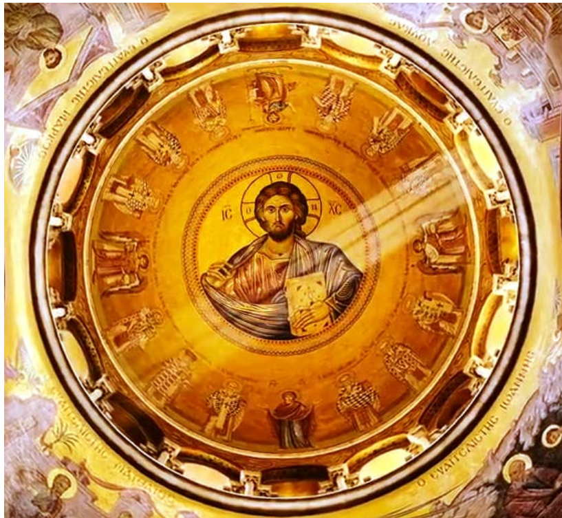
The picture of Jesus in the Church of Holy Sepulcher in Jerusalem.

The fact is there is no forgiveness of sin for the Jewish people that keep the Torah except through Rabbi Yeshua. Yeshua came on earth, sent by God the Father, to save the Jewish people that live under the Law of Moses. There is no salvation for anyone on earth through the false name of Jesus. There is no salvation for the people on earth that are not under the Law.