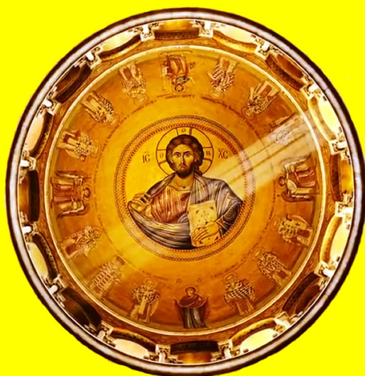
Image of Jesus comes from the picture of Zeus, King of all the Gods of Mt Olympus